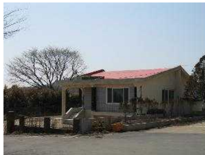
A Studio 1, 2