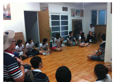
Kitchen1, Rest room1, Living room1